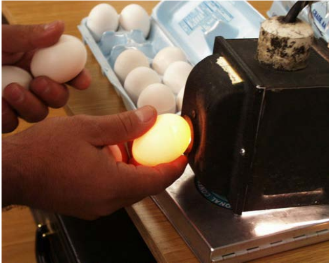
Candling an egg.

Note on candling dark brown eggs: In order to properly candle dark brown eggs, you will need a candling light with a magnifier specifically made for eggs. These can be purchased through a poultry supply company.